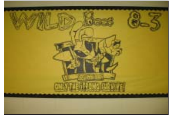
TEAM 8-3 Wild Bees