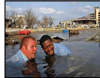
Relief efforts in Louisiana

Nearly two weeks ago, Hurricane Katrina slammed into the coast of Louisiana. The 130 m.p.h. winds worked with the non-stop rain to cause immeasurable damage. Probably the hardest hit was the city of New Orleans. Parts of the bowl-shaped city