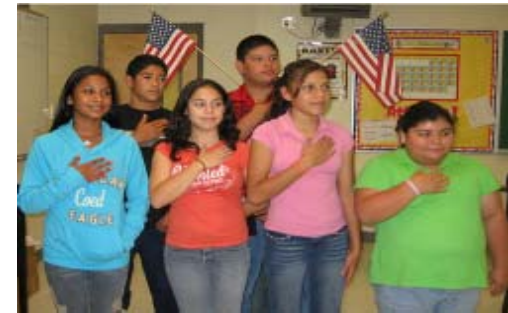
Students at Carlos F. Truan Jr. High recite the pledge of allegiance during morning announcements.