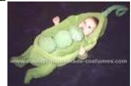
BY: RICKY RANGEL