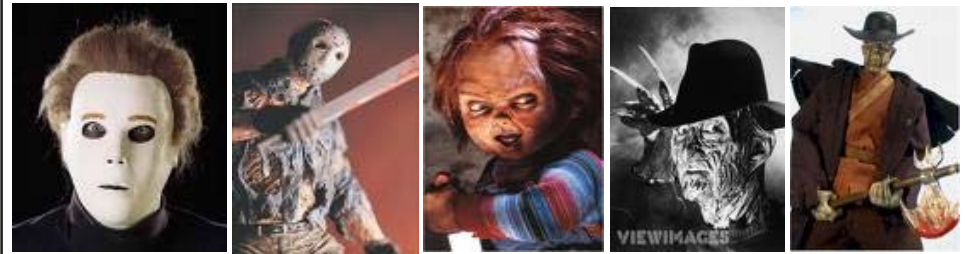
Michael Myers Jason Voorhees Chucky Freddy Kreuger Jeepers Creepers