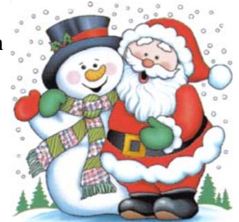
Christmas joy warms the heart

Saint Nicholas, also known as Santa Claus, was born over a thousand years ago. When he was a young priest, he secretly gave three gold coins to three very poor girls. The father of the girls found out and thanked Saint Nick. Saint Nick was very embarrassed that he asked the man to keep his deed a secret. The man kept Nicholas secret for a while, but eventually told everybody that he had done a good deed.